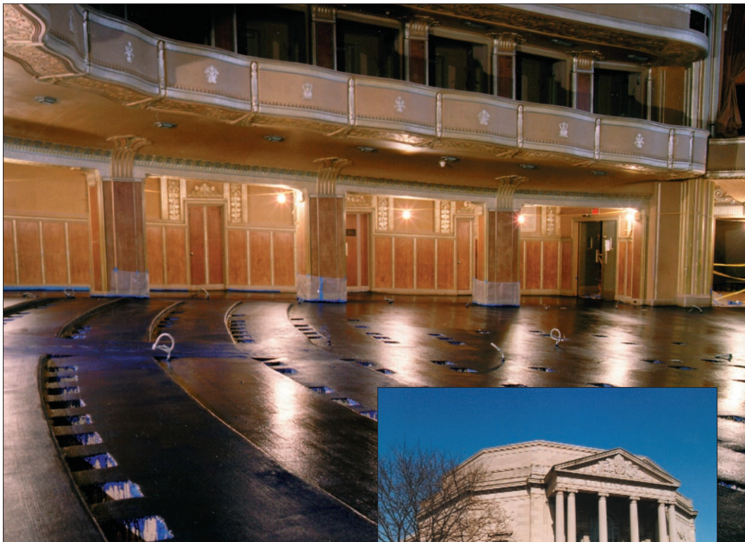
The above photo is the finished floor restoration of Severance Hall. To the right is Severance Hall.

ChemMasters was called on to provide a solution.