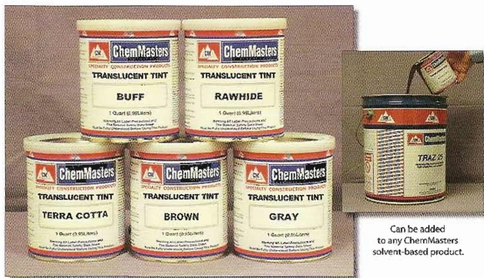
Can be added to any ChemMasters solvent-based product.

Translucent Tint is concentrated tint that can be mixed with a clear, solvent-based sealer or cure & seal product to create a translucent stain for concrete and masonry.